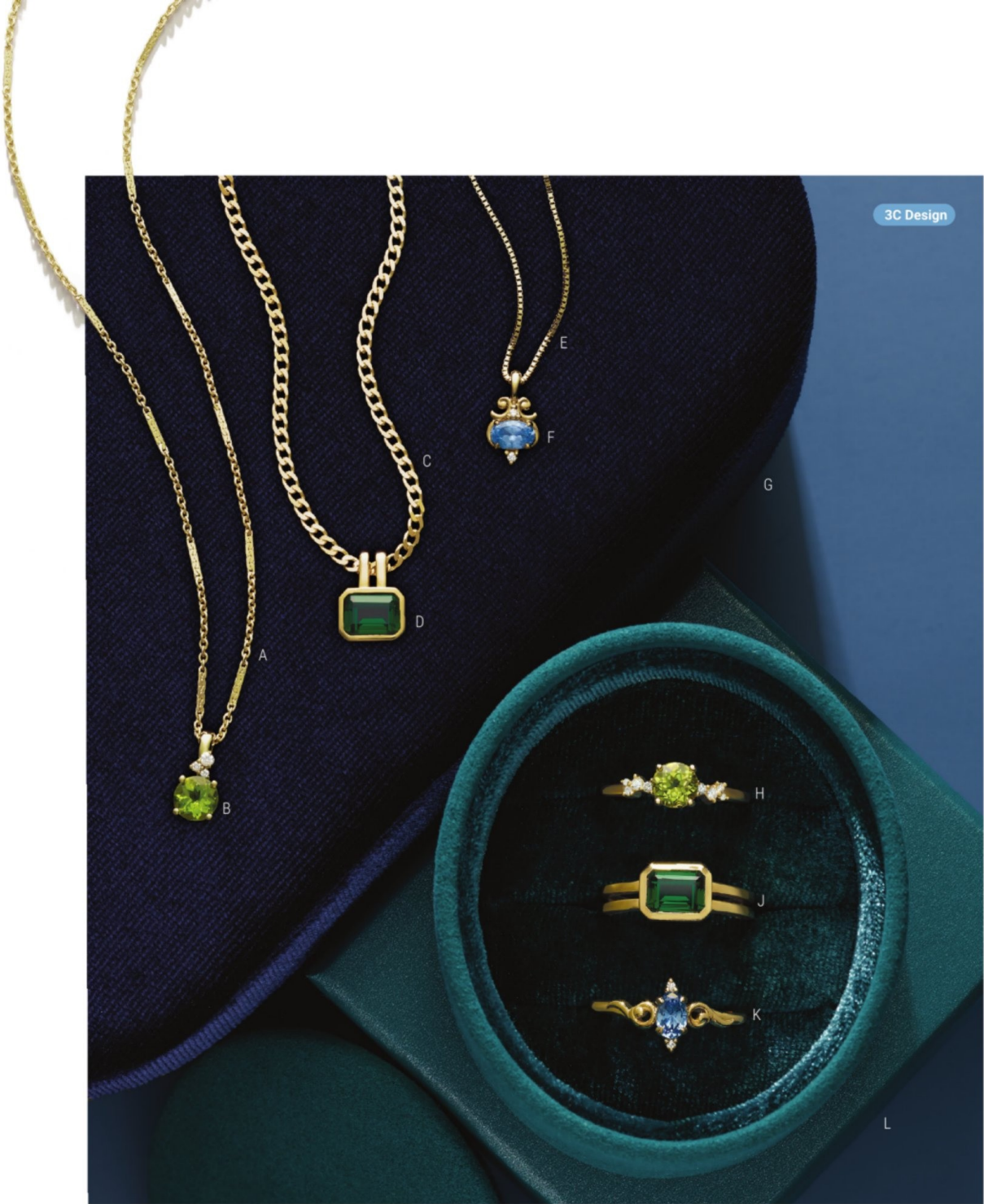
A. CH1242 Dapped Cable Chain with Lobster Clasp, 1.1mm, 14K Yellow, 18", $715 | B. 88566 Accented Pendant Mounting for Round Stone, 6mm, 14K Yellow, $339 | C. CH1237 Curb Chain with Lobster Clasp, 2.35mm, 14K Yellow, 18", $1,255 | D. 88591 Pendant Mounting for Emerald Stone, 8x6mm, 14K Yellow, $619 | E. CH619 Box Chain with Lobster Clasp, .75mm, 14K Yellow, 18", $479 | F. 88542 Pendant Mounting for Oval Stone, 6x4mm, 14K Yellow, $355 | G. 61-9941 Opulence Collection Navy Velvet Travel Case, $30.10 | H. 126549 Accented Ring Mounting for Round Stone, 6mm, 14K Yellow, $789 | J. 72399 Ring Mounting for Emerald Stone, 8x6mm, 14K Yellow, $1,449 | K. 72392 Accented Ring Mounting for Oval Stone, 6x4mm, 14K Yellow, $719 | L. 61-6083 Cecile Collection Teal Suede Triple Ring Box, $10.90 | M. 72401 Freeform Ring Mounting for Oval Stone, 7x5mm, 14K Yellow, $1,125