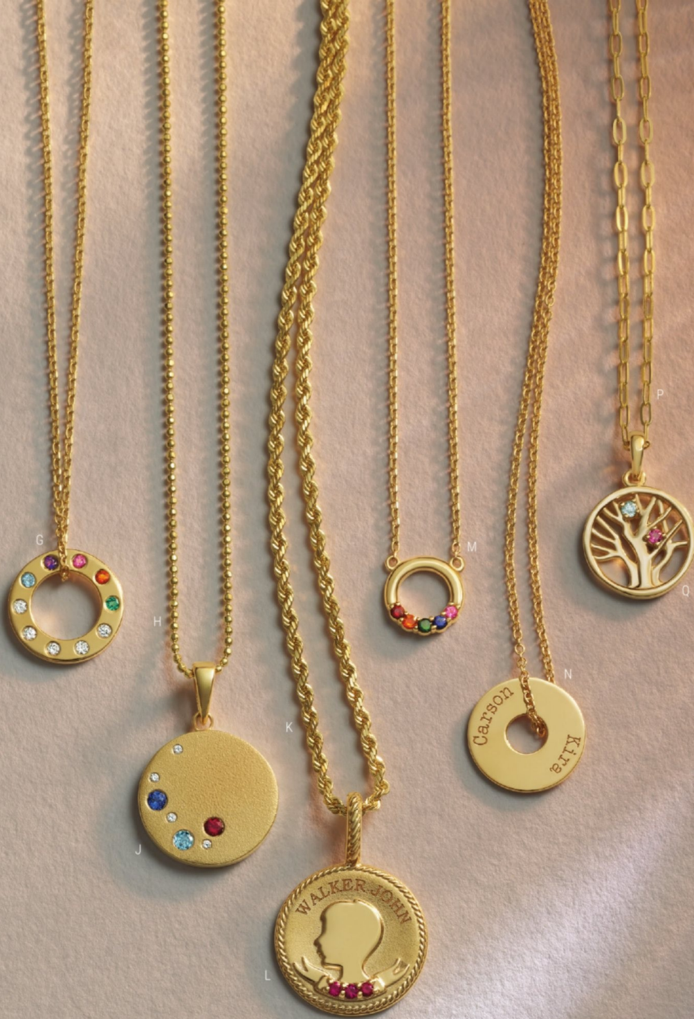
A. 72156 Family Ring Mounting for for Round Stones, 6- 2.5mm, 14K Yellow, $649 | B. 57739 Mama Ring, 3mm, 14K Yellow, $549 | C. 67401 Natural Diamond Stackable Band, \frac{1}{3} ctw, 14K Yellow, 638, $1,345 | D. 72351 Engravable Family Stackable Ring Mounting for Round Stones, 4- 2mm, 14K Yellow, $989 | E. 72340 French-Set Stackable Family Ring Mounting for Round Stones, 11- 2mm, 14K Yellow, $705 | F. 72378 Natural Diamond Semi-Set Family Ring Mounting for for Round Stones, \frac{1}{8} ctw, 3- 2.5mm, 14K Yellow, 33, $955 | G. 88320 Natural Diamond Semi-Set Family Necklace Mounting for Round Stones, .07 ctw, 5- 1.5mm, 14K Yellow, 16-18", 33, $889 | H. CH1093 Diamond-Cut Bead Chain with Lobster Clasp, 1mm, 14K Yellow, 18", $525 | J. 87189 Natural Diamond Semi-Set Family Pendant Mounting for Round Stones, .02 ctw, 3- 2mm, 22.3x15mm, 14K Yellow, 33, $979 | K. CH948 Diamond-Cut Rope Chain with Lobster Clasp, 1.6mm, 14K Yellow, 18", $1,039 | L. 88518 Natural Ruby Engravable Boy Silhouette Pendant, 24x16.5mm, 14K Yellow, 66, $1,099 | M. 88269 Family Circle Necklace Mounting for Round Stones, 5- 1.5mm, 14K Yellow, 18", $565 | N. 88510 Engravable Washer Necklace, 12mm, 14K Yellow, 16-18", $665 | P. CH1235 Paperclip-Style Chain with Lobster Clasp, 1.25mm, 14K Yellow, 18", $429 | O. 88242 Family Tree Pendant Mounting for Round Stones, 2- 1.5mm, 14K Yellow, $339