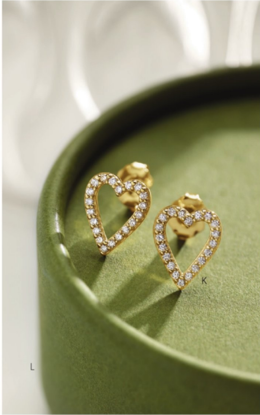
A. 88100 Hinged Heart Huggie Earrings, 15x15mm, 14K Yellow, $589 B. 689129 Natural Diamond Heart Necklace, 1/4 ctw, 14K Yellow, 18", 33, $1,505 | C. 689142 Lab-Grown Diamond Necklace, 3 1/4 ctw, 14K Yellow, 18", 618, $5,965 | D. 88484 Pierced Mama Necklace, 16.6x11.2mm, 14K Yellow, 18", $945 | E. BRC962 Heart and Paperclip-Style Chain Bracelet, 14x11mm, 14K Yellow, 7", $645 F. 88189 Natural Tanzanite Stud Earrings, 4mm, 14K Yellow, 156, $529 | G. 88091 Natural White Sapphire Stud Earrings, 5x5mm, 14K Yellow, 513, $669 | H. 88634 Double Heart Stud Earrings, 8.5x6mm, 14K Yellow, $255 | J. 88473 Mama Earrings, 9x4mm, 14K Yellow, $245 | K. 88612 Natural Diamond Heart Earrings, 1/4 ctw, 12.15x10mm, 14K Yellow, 33, $1,429 | L. 61-9878 Vita Collection Green Earring/Pendant Box (Pack of 10), $45.10