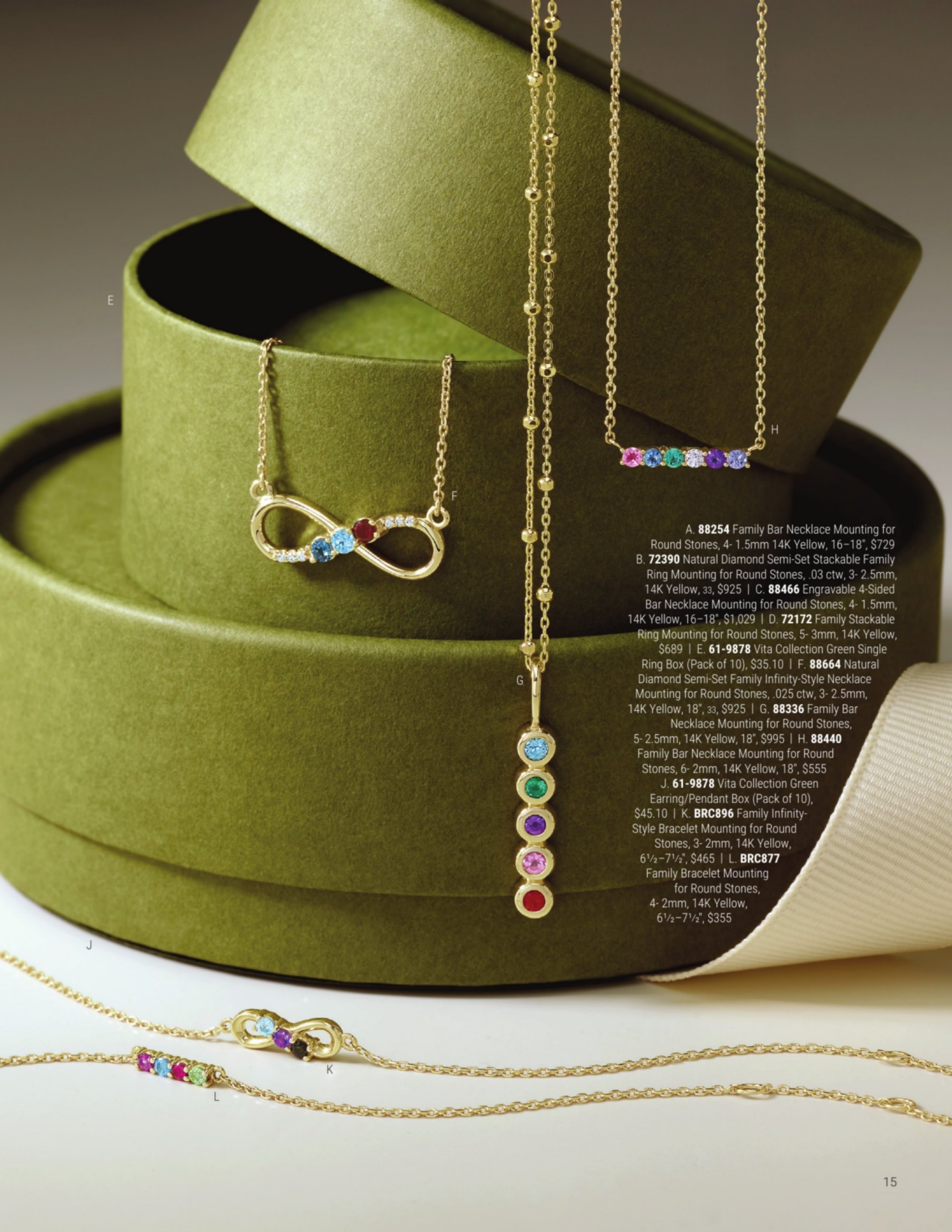
A. 88254 Family Bar Necklace Mounting for Round Stones, 4- 1.5mm 14K Yellow, 16-18", $729 B. 72390 Natural Diamond Semi-Set Stackable Family Ring Mounting for Round Stones, .03 ctw, 3- 2.5mm, 14K Yellow, 33, $925 | C. 88466 Engravable 4-Sided Bar Necklace Mounting for Round Stones, 4- 1.5mm, 14K Yellow, 16-18", $1,029 | D. 72172 Family Stackable Ring Mounting for Round Stones, 5- 3mm, 14K Yellow, $689 | E. 61-9878 Vita Collection Green Single Ring Box (Pack of 10), $35.10 | F. 88664 Natural Diamond Semi-Set Family Infinity-Style Necklace Mounting for Round Stones, .025 ctw, 3- 2.5mm, 14K Yellow, 18", 33, $925 | G. 88336 Family Bar Necklace Mounting for Round Stones, 5- 2.5mm, 14K Yellow, 18", $995 | H. 88440 Family Bar Necklace Mounting for Round Stones, 6- 2mm, 14K Yellow, 18", $555 J. 61-9878 Vita Collection Green Earring/Pendant Box (Pack of 10), $45.10 | K. BRC896 Family Infinity-Style Bracelet Mounting for Round Stones, 3- 2mm, 14K Yellow, 6½-7½", $465 | L. BRC877 Family Bracelet Mounting for Round Stones, 4- 2mm, 14K Yellow, 6½-7½", $355