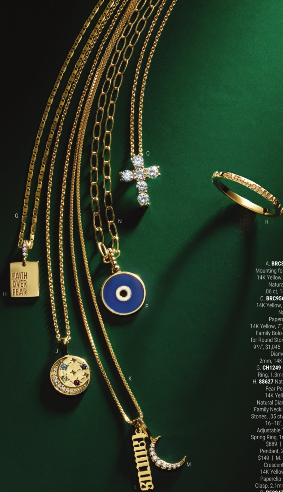
A. BRC897 Family Cuff Bracelet Mounting for Round Stones, 5- 3mm, 14K Yellow, 7", $3,025 | B. BRC891 Natural Diamond Link Bracelet, .06 ct, 14K Yellow, 7 \frac{1}{2} ", 33, $589 | C. BRC956 Beaded Bracelet, 3mm, 14K Yellow, 7", $1,485 | D. BRC924 Natural Diamond Line and Paperclip-Style Bracelet, 1 ctw, 14K Yellow, 7", 33, $3,859 | E. BRC915 Family Bolo-Style Bracelet Mounting for Round Stones, 4- 3mm, 14K Yellow, 9 \frac{1}{2} ", $1,045 | F. BRC894 Lab-Grown Diamond Bolo-Bracelet, 1 ctw, 2mm, 14K Yellow, 9 \frac{1}{2} ", 618, $2,129 | G. CH1249 Mirror Chain with Spring Ring, 1.3mm, 14K Yellow, 18", $365 | H. 88627 Natural Diamond Faith Over Fear Pendant, .02 ctw, 16x8mm, 14K Yellow, 33, $369 | I. 88402 Natural Diamond Semi-Set Celestial Family Necklace Mounting for Round Stones, .05 ctw, 4- 1.5mm, 14K Yellow, 16-18", 33, $1,155 | K. CH1205 Adjustable Threader Box Chain with Spring Ring, 1mm, 14K Yellow, 16-22", $889 | L. 88582 Gothic Taurus Pendant, 20.5x4.8mm, 14K Yellow, $149 | M. 88223 Natural Diamond Crescent Moon Pendant, .07 ctw, 14K Yellow, 33, $515 | N. CH1099 Paperclip-Style Chain with Lobster Clasp, 2.1mm, 14K Yellow, 18", $679 | P. R50047 Blue Enameled Evil Eye Pendant, 12.3mm, 14K Yellow, $469 | Q. R42309 Lab-Grown Diamond Cross Necklace, \frac{3}{4} ctw, 14K Yellow, 18", 618, $1,189 | R. 57935 Faith Not Fear Ring, 2.1mm, 14K Yellow, $715