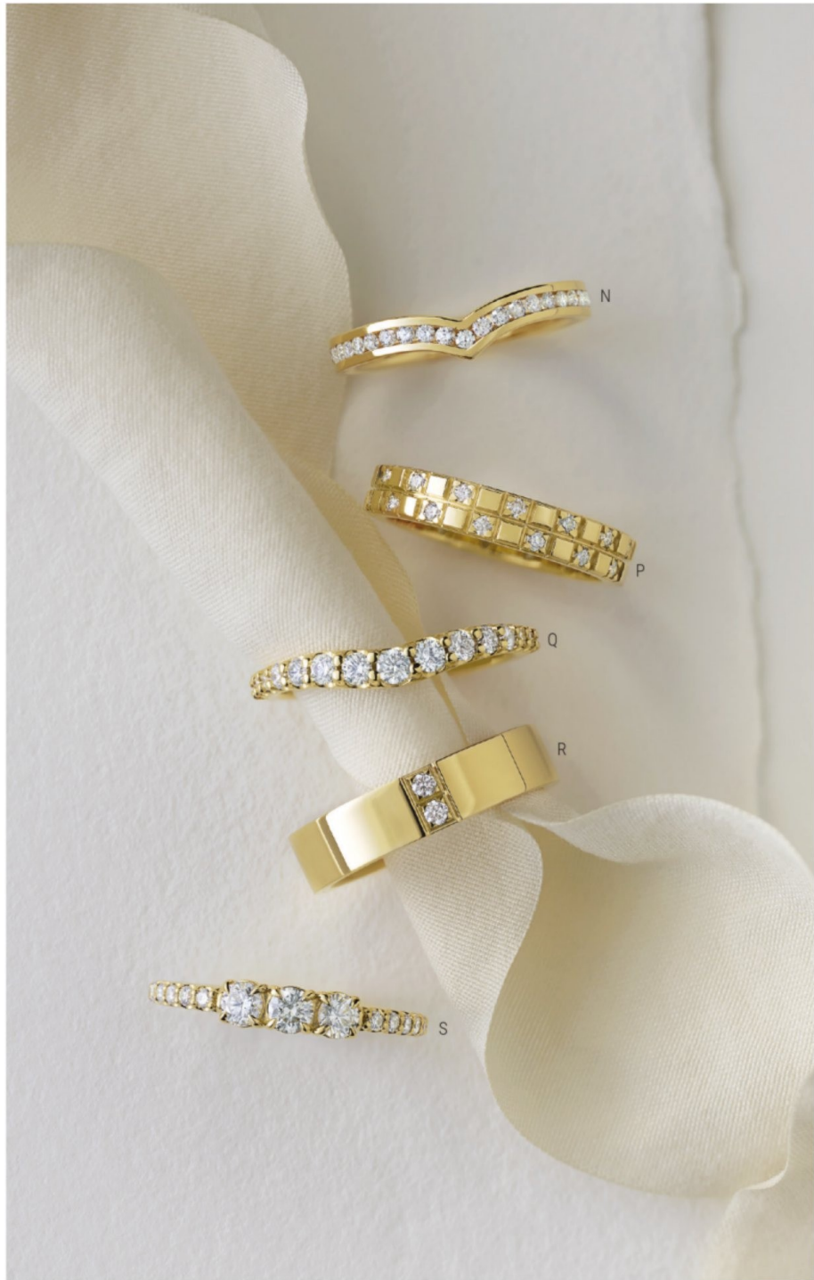
A. Lab-Grown Diamond 1.85 ct | B. Natural Diamond 2.19 ct | C. Lab-Grown Diamond 9.52 ct | D. Lab-Grown Diamond 1.78 ct | E. Natural Diamond 2.04 ct | F. Lab-Grown Diamond 9.50 ct | G. Canadmark Diamond 1.41 ct | H. Lab-Grown Diamond 1.63 ct | J. Lab-Grown Diamond 1.54 ct | K. Natural Diamond 1.75 ct | L. Natural Diamond 1.56 ct | M. GCAL 8x Lab-Grown Diamond 2.18 ct | N. 123090 Natural Diamond Contour Band, 1/4 ctw, 14K Yellow, 32, $1,585 | P. 126466 Natural Diamond Ring, 3/8 ctw, 14K Yellow, 32, $2,309 | Q. 123204 Natural Diamond Contour Band, 1/2 ctw, 14K Yellow, 32, $2,935 | R. 126435 Natural Diamond Ring, .05 ctw, 14K Yellow, 32, $1,759 | S. 126686 Natural Diamond Anniversary Band, 3/8 ctw (3.5mm), 14K Yellow, 32, $2,935