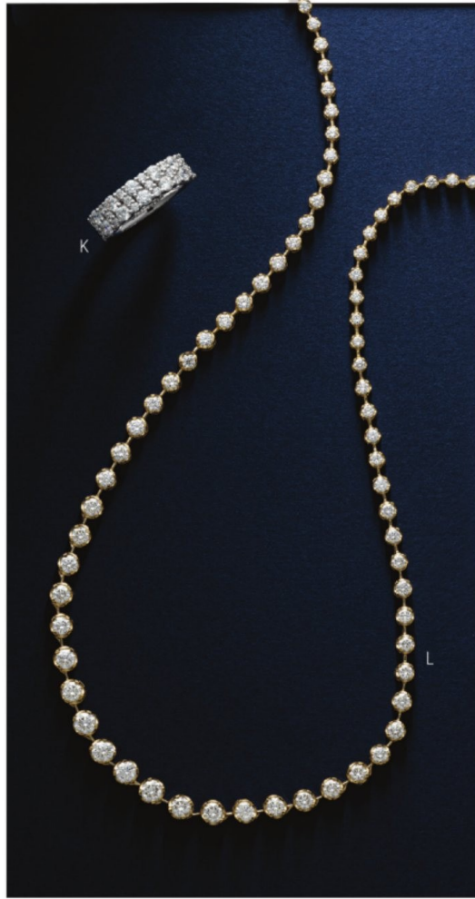
A. 688758 White Freshwater Cultured Pearl Huggie Earrings, 13.98mm, 14K Yellow, 16, $779 | B. 88556 White Freshwater Cultured Pearl Earrings, 4.1x3.1mm, 14K Yellow, 650, $499 C. 88488 Natural Diamond and White Akoya Cultured Pearl Necklace, .04 ctw, 14K Yellow, 16-18", 33, 528, $1,019 | D. 688757 White Freshwater Cultured Pearl Ring, 3mm, 14K Yellow, 650, $485 E. 6705 White Akoya Cultured Pearl Leaf Ring, 6mm, 14K Yellow, 528, $1,079 | F. 689147 Freshwater Cultured Pearl Bracelet with Heart Dangle, 5.5mm, 14K Yellow, 7-8", 650, $569 | G. 652480* Lab-Grown Diamond Stud Earrings, 3 ctw, 14K White, 618, $3,485 | H. BRC951* Lab-Grown Diamond Line Bracelet, 12 ctw, 14K White, 7", 618, $14,315 J. 88079 Lab-Grown Diamond Stud Earrings, 1/5 ctw, 2.6mm, 14K Yellow, 618, $709 | K. 689115* Lab-Grown Diamond Anniversary Band, 1 1/6 ctw, 14K White, 618, $1,825 | L. 653717 Lab-Grown Diamond Graduated Necklace, 6 3/4 ctw, 14K Yellow, 16", 618, $8,759