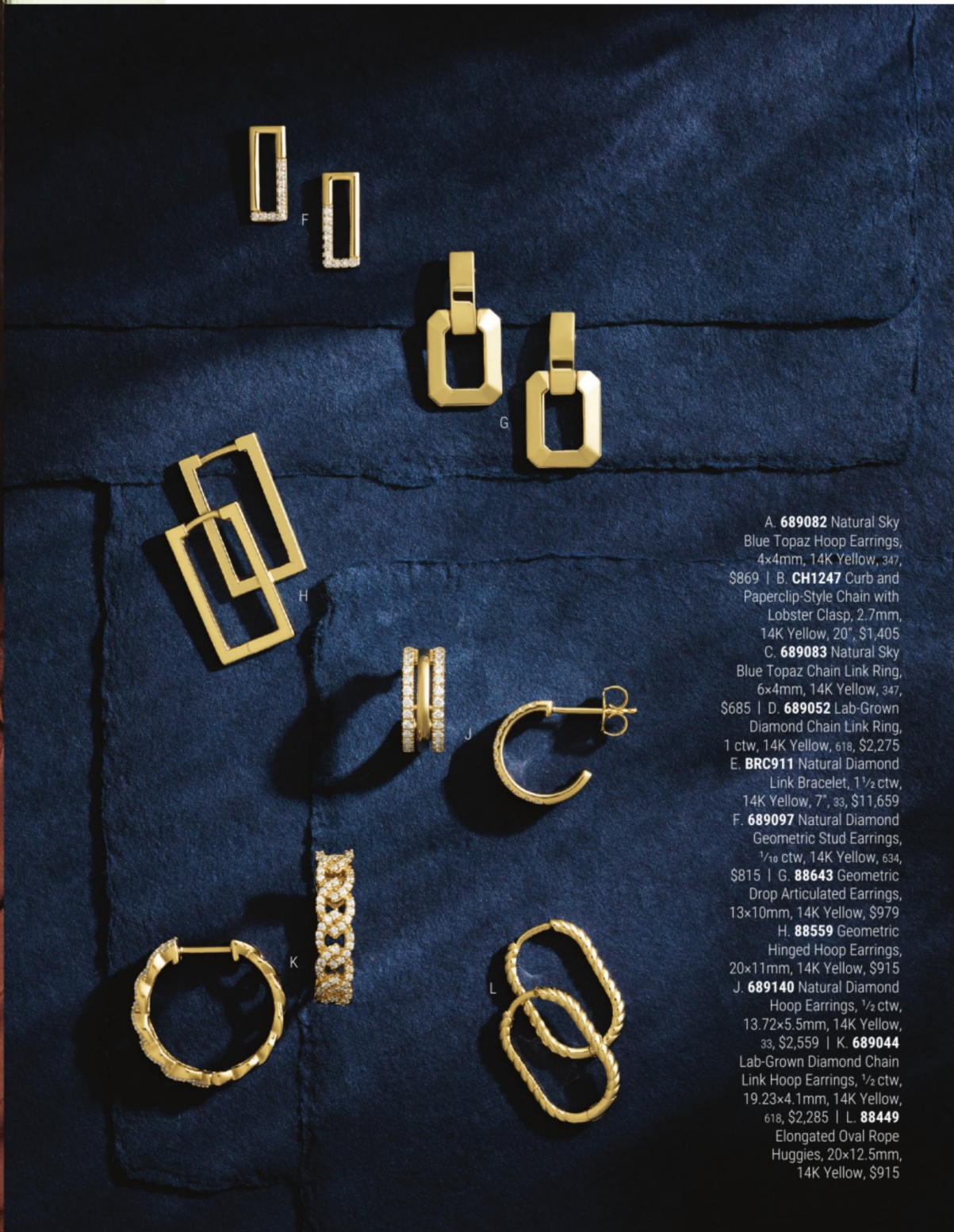
A. 689082 Natural Sky Blue Topaz Hoop Earrings, 4x4mm, 14K Yellow, 347, $869 | B. CH1247 Curb and Paperclip-Style Chain with Lobster Clasp, 2.7mm, 14K Yellow, 20", $1,405 | C. 689083 Natural Sky Blue Topaz Chain Link Ring, 6x4mm, 14K Yellow, 347, $685 | D. 689052 Lab-Grown Diamond Chain Link Ring, 1 ctw, 14K Yellow, 618, $2,275 | E. BRC911 Natural Diamond Link Bracelet, 1½ ctw, 14K Yellow, 7", 33, $11,659 | F. 689097 Natural Diamond Geometric Stud Earrings, ¼ ctw, 14K Yellow, 634, $815 | G. 88643 Geometric Drop Articulated Earrings, 13x10mm, 14K Yellow, $979 | H. 88559 Geometric Hinged Hoop Earrings, 20x11mm, 14K Yellow, $915 | J. 689140 Natural Diamond Hoop Earrings, ½ ctw, 13.72x5.5mm, 14K Yellow, 33, $2,559 | K. 689044 Lab-Grown Diamond Chain Link Hoop Earrings, ½ ctw, 19.23x4.1mm, 14K Yellow, 618, $2,285 | L. 88449 Elongated Oval Rope Huggies, 20x12.5mm, 14K Yellow, $915